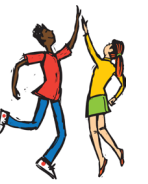
KUDOS TO OUR KIDS!

It is the season for our students to begin receiving awards and accolades for their good work. If your child or student receives an award, please write down the details and drop the information by the church office. We will be glad to put it in the bulletin. This week's kudos go to . . .