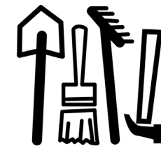
Great Day of Service