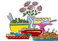
Golden Agers Luncheon

Covered dish lunch and program. Everyone age 50+ is invited!